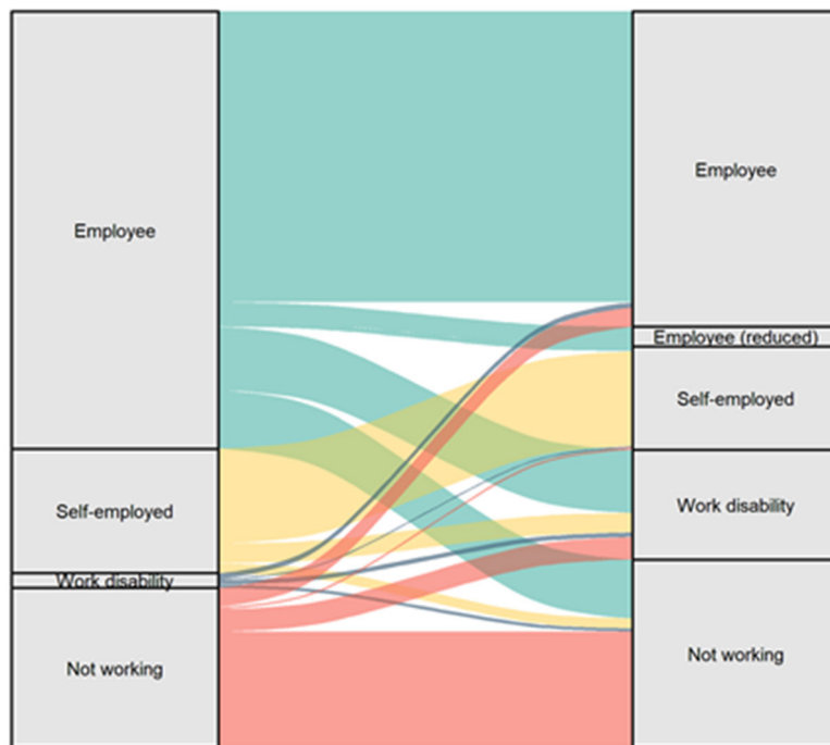
FIGURE 2 Alluvial plot displaying employment status pre-TBI and 1-year post-TBI.