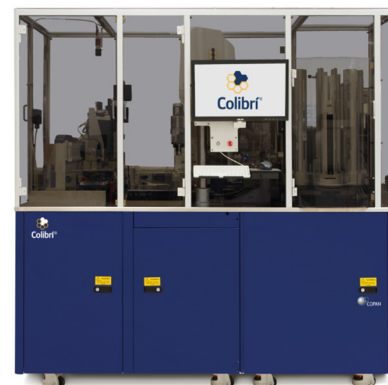
FIG 1 MALDI-TOF target preparation steps using Colibrí. Graphical overview of the Colibrí colony-picking mechanism. (Adopted and modified from reference 9 with permission of the publisher.)

time. With ongoing evolution toward more automation in clinical microbiology laboratories, providing better traceability and standardization, Copan (Brescia, Italy) recently introduced the Colibrí instrument. This device can pick colonies from culture plates selected using WASPLab (Copan) and use them for preparation of MALDI-TOF target plates (6). Bielli et al. obtained an agreement of 96.9% and 82.6% between Colibrí and the manual spot-plating method for identification of 33 Gram-negative and 23 Gram-positive bacterium strains, respectively (7). Similarly good results were shown by Paolucci et al., where all Gram-negative uropathogens spot-plated using Colibrí were correctly identified using the MALDI Biotyper (Bruker, Bremen, Germany), and a 100% agreement in identification results was observed between the different culture media used in this study (8). However, the Colibrí system has not yet been validated for yeast identification. In this study, we therefore aim to evaluate the performance of Colibrí for target preparation of yeasts and subsequent identification with MALDI-TOF.